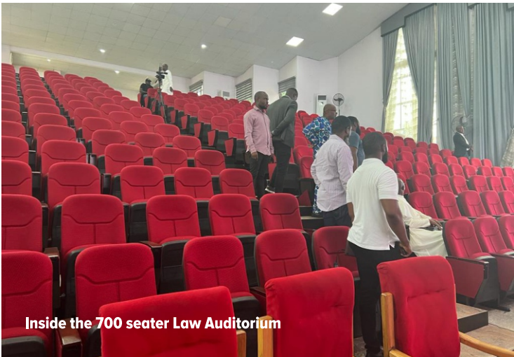
Inside the 700 seater Law Auditorium