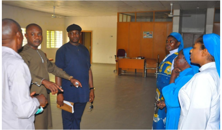
Pictures 4-9: 40-bed hospital in Owo, Nkanu East LGA, built and maintained by the Peter Mbah Foundation for the healthcare of community people.